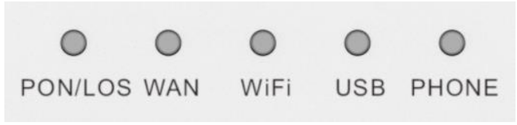
Figure 3. Panel Lights