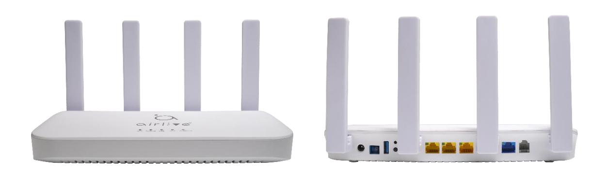
Figure 1. ONU-10XG(S)-AX304P-2.5G